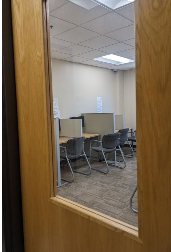
Figure 6. Noise limited spaces.

In another suite, there are rooms which reduce noise (Figures 6 and 7).