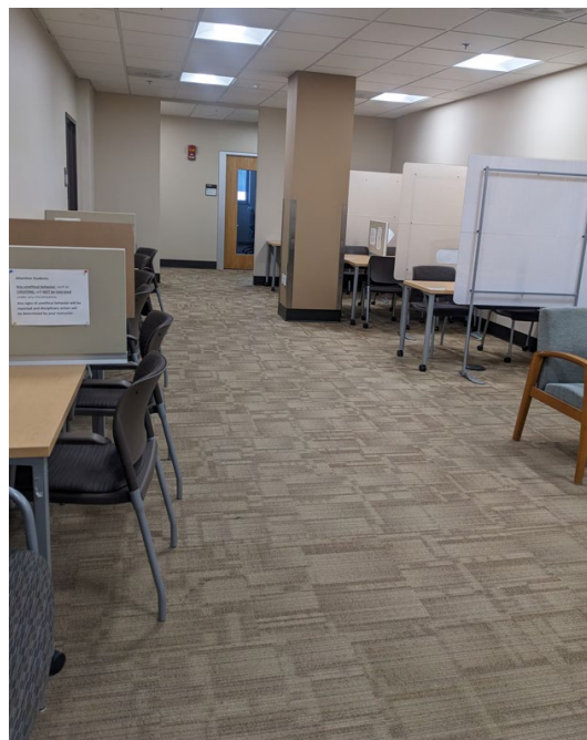
Figure 3. DRC lobby and semi-private testing space

The DRC lobby area is in a large room that also contains ~30 semi-private testing desks (Figure 3). In this space, a proctor is present at all times, and 3 cameras are located in the area for surveillance. This room is adjacent to staff offices for consultation of students, and is divided by a sliding door which is kept open. David mentioned that this space is busy 8 times per year, including common hour exams (4), midterms, and finals. The DRC conducts roughly 10,000+ accommodated tests per year in the DRC designated testing spaces.