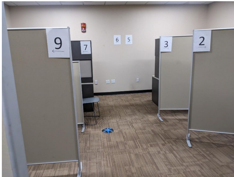
Figure 8. Private sound attenuation testing space.

Finally, David led the group to a room which had 9 private desks with noise cancelling headphones (Figures 8 and 9). David mentioned that UK DRC has the most desks for accommodations in this space than any other SEC institution, although other universities are quickly approaching UK's capacity.