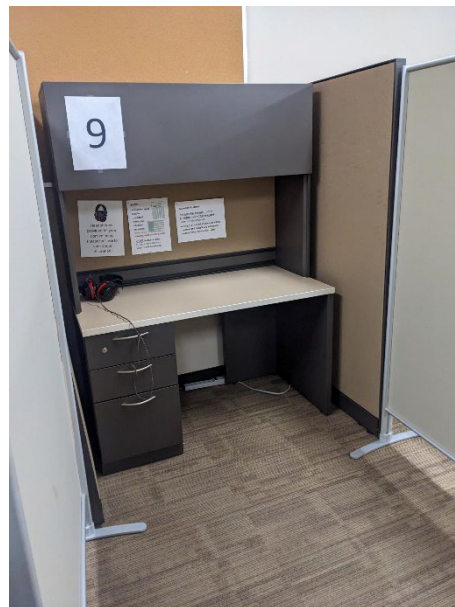
Figure 9. Desk which can be cornered off for privacy and headphones for sound attenuation.

Gipson-Reichardt adjourned the meeting at 3:00PM.