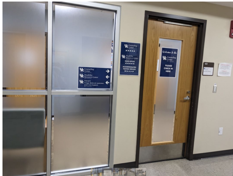
Figure 1. DRC hallway.

David Beach initiated the tour through the main corridor of the 4 th floor of the Multidisciplinary Science Building, first describing how the Counseling Center is located adjacent to the DRC facilities on the floor. David explained that the hallways are monitored via cameras by DRC staff. Next, the group toured the DRC lobby area (Figure 1).