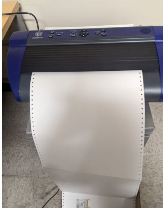
Figure 2. Braille machine

The DRC lobby area is in a large room that also contains ~30 semi-private testing desks (Figure 3). In this space, a proctor is present at all times, and 3 cameras are located in the area for surveillance. This room is adjacent to staff offices for consultation of students, and is divided by a sliding door which is kept open. David mentioned that this space is busy 8 times per year, including common hour exams (4), midterms, and finals. The DRC conducts roughly 10,000+ accommodated tests per year in the DRC designated testing spaces.