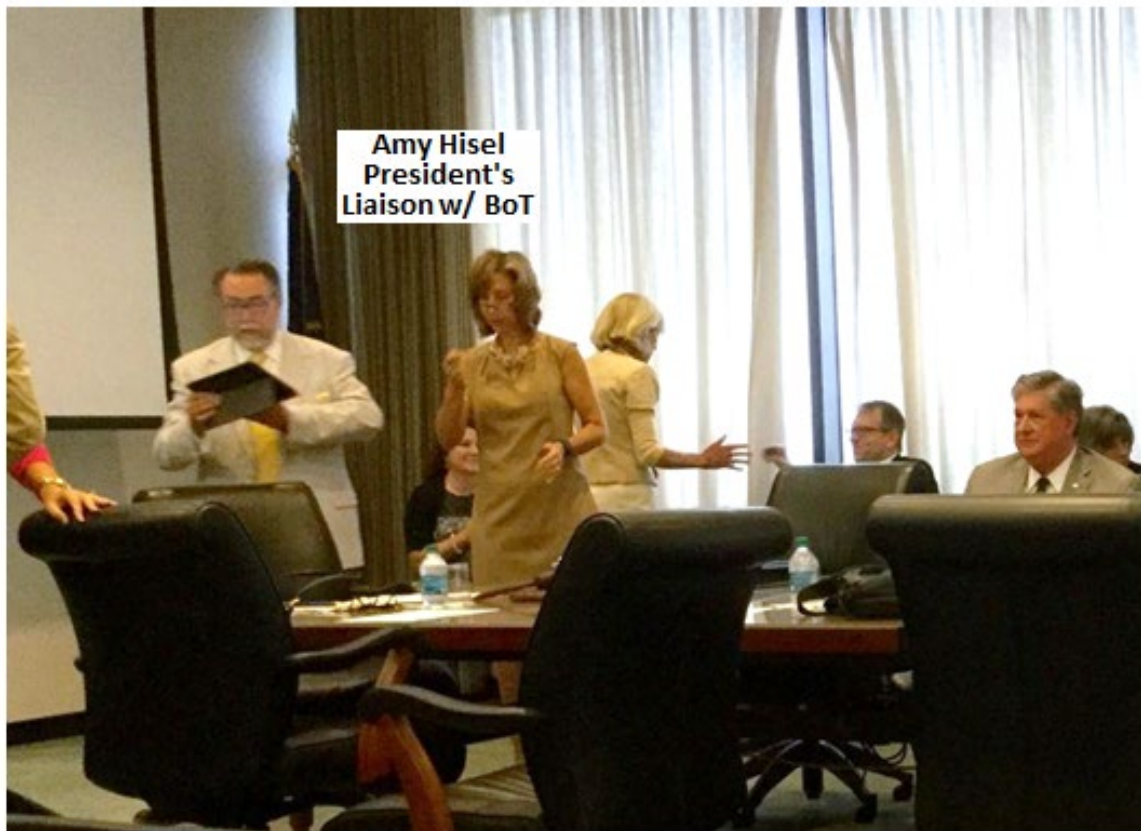
Board of Trustees Meeting June 24, 2016; Board Room 18th Floor POT