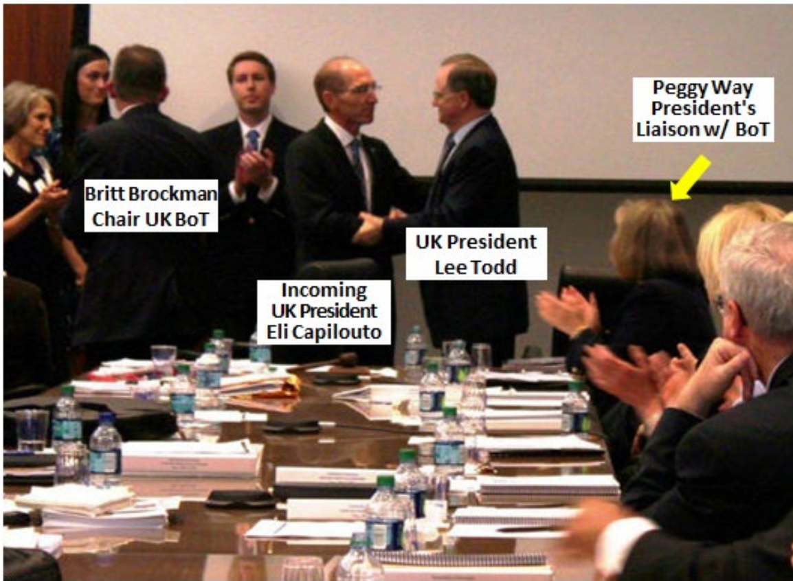
Board of Trustees Meeting May 3, 2012; Board Room 18th Floor POT