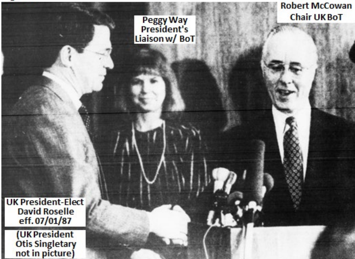
Board of Trustees March 3, 1987; Board Room 18th Floor