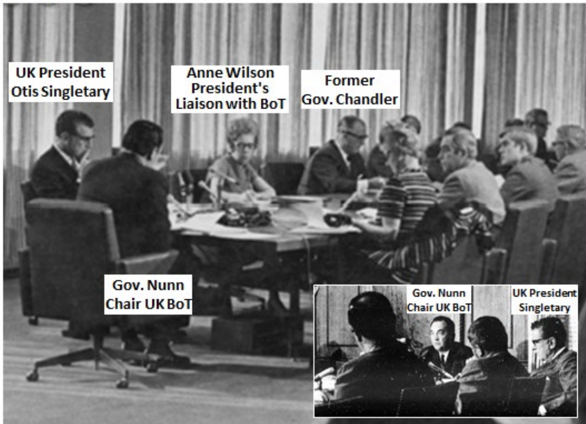
Board of Trustees Meeting Dec. 9, 1969; First Meeting in New Board Room 18th Floor Patterson Office Tower (inset shows 10-21-69 meeting in old Board Room) UK Special Collections