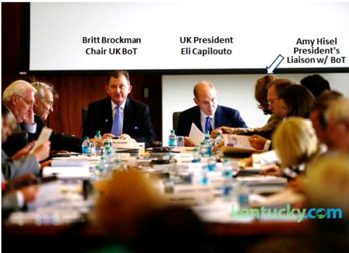
Board of Trustees Meeting June 10, 2014; Board Room 18th Floor POT