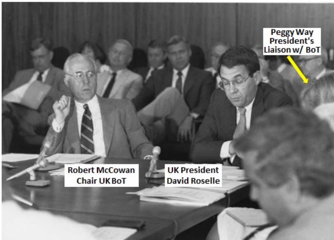
Board of Trustees Meeting 1987 or 1988; Board Room 18th Floor POT UK Special Collections