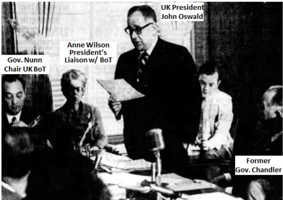
Board of Trustees Meeting April 2, 1968; Board Room 101 Main Building Courier-Journal