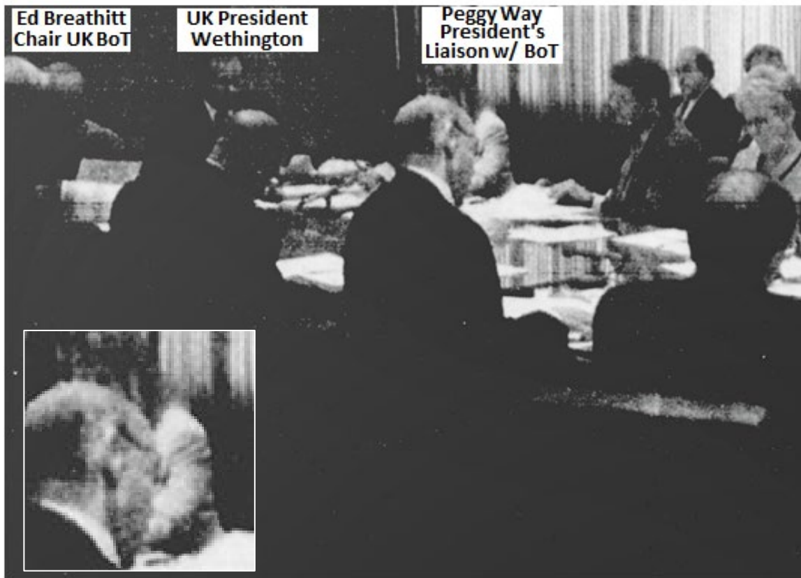
Board of Trustees Meeting June 8, 1999; Board Room 18th Floor POT Ky Kernel