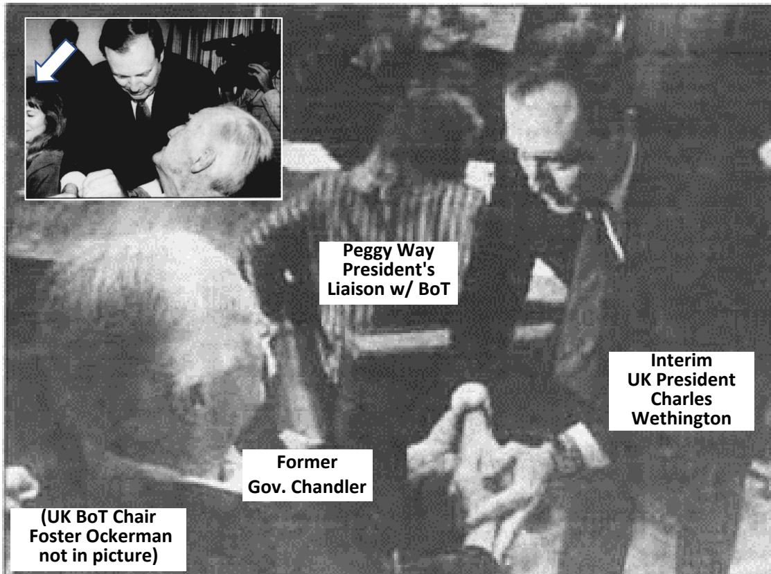
Board of Trustees Meeting Dec. 29, 1989; Board Room 18th Floor POT Cuurier-Journal (inset Ky Kernel)