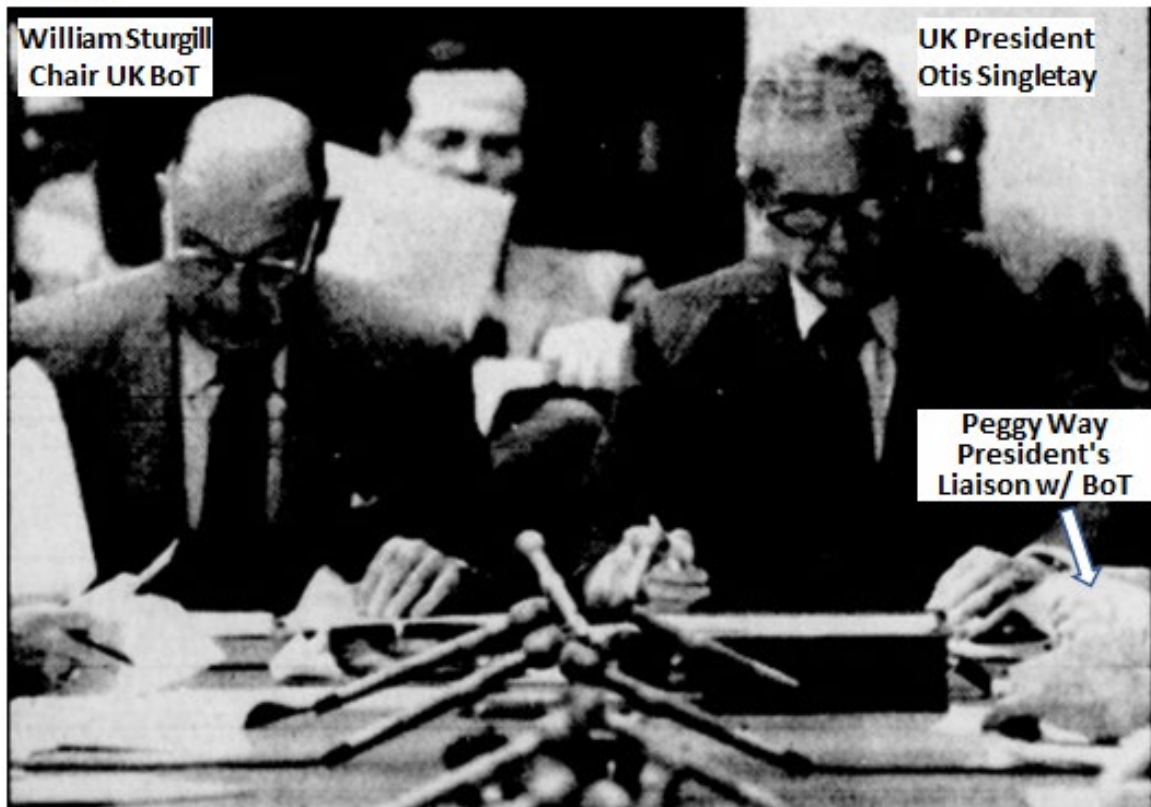
Board of Trustees Jan. 26, 1982; Board Room 18th Floor POT Ky Kernel